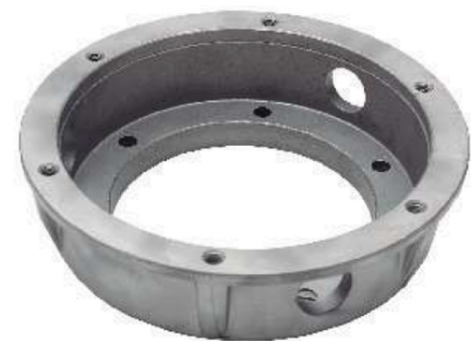
* Fan clutch flange (OE: A5410350914 )

Required for installation of the bimetallic fan clutch (not included in the set)